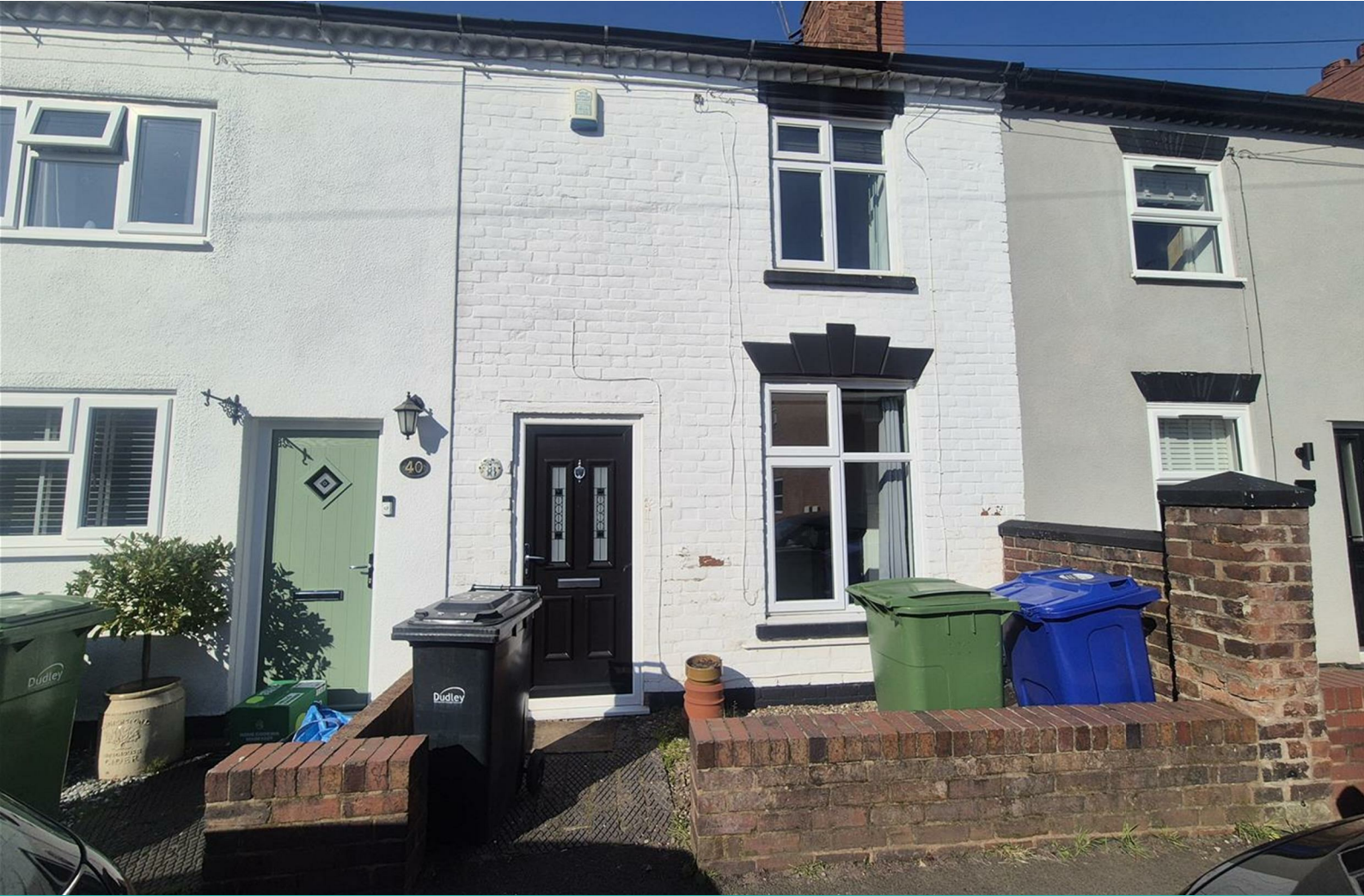
38 Hill Street, Stourbridge DY8 1AL