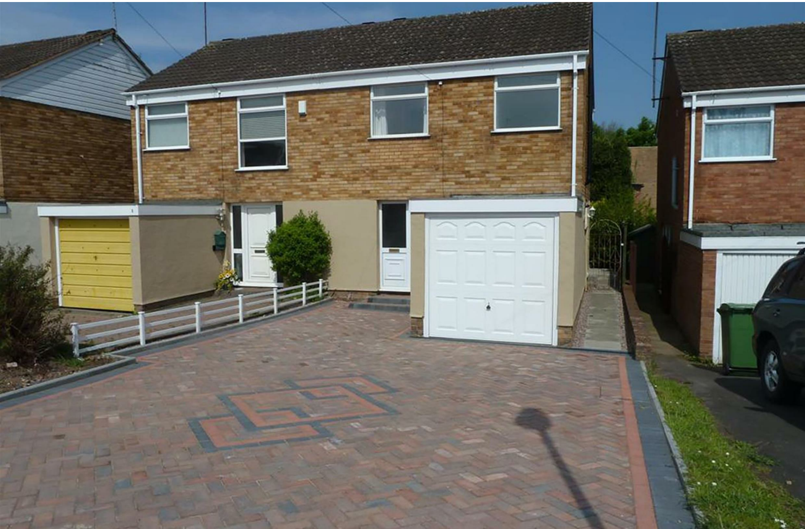
7 Nursery Gardens, Stourbridge DY8 4AS