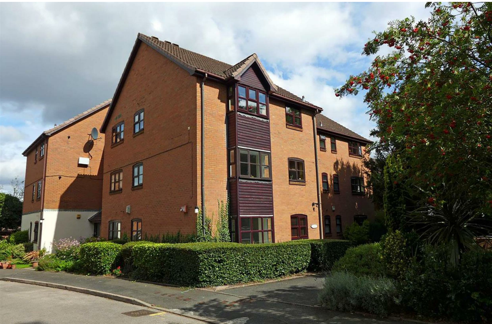
6 Grosvenor Court, Pedmore DY9 0RY