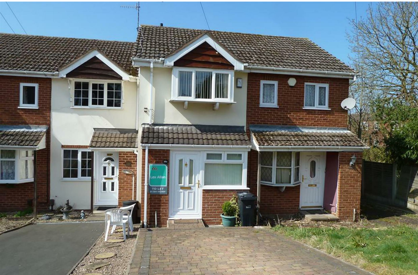
35d Church Street, Brierley Hill DY5 4HB