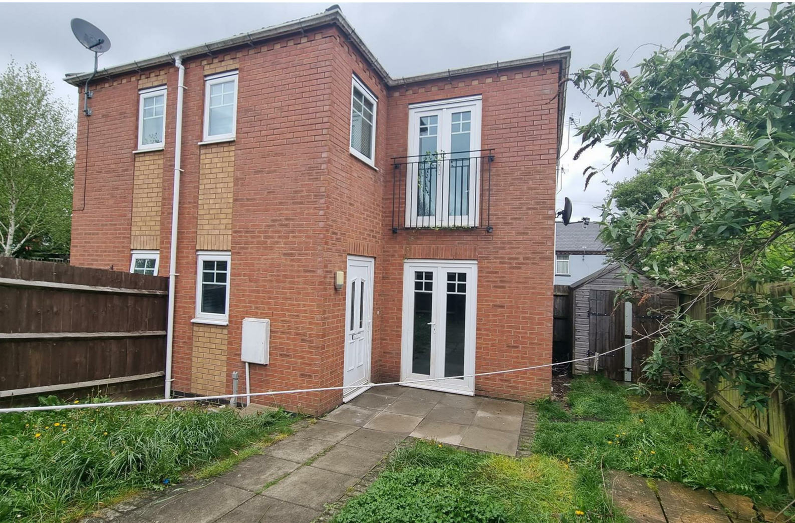
30 Clarence Street, DY3 1UP