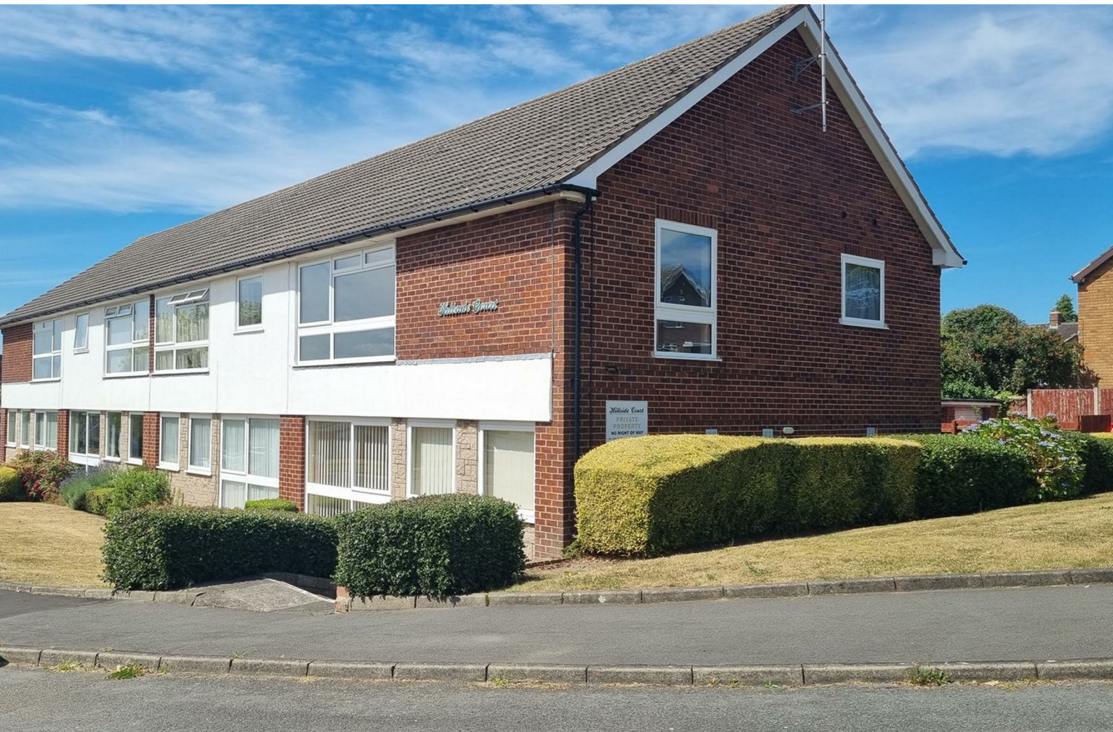
5 Hillside Court, Stourbridge DY9 0TP