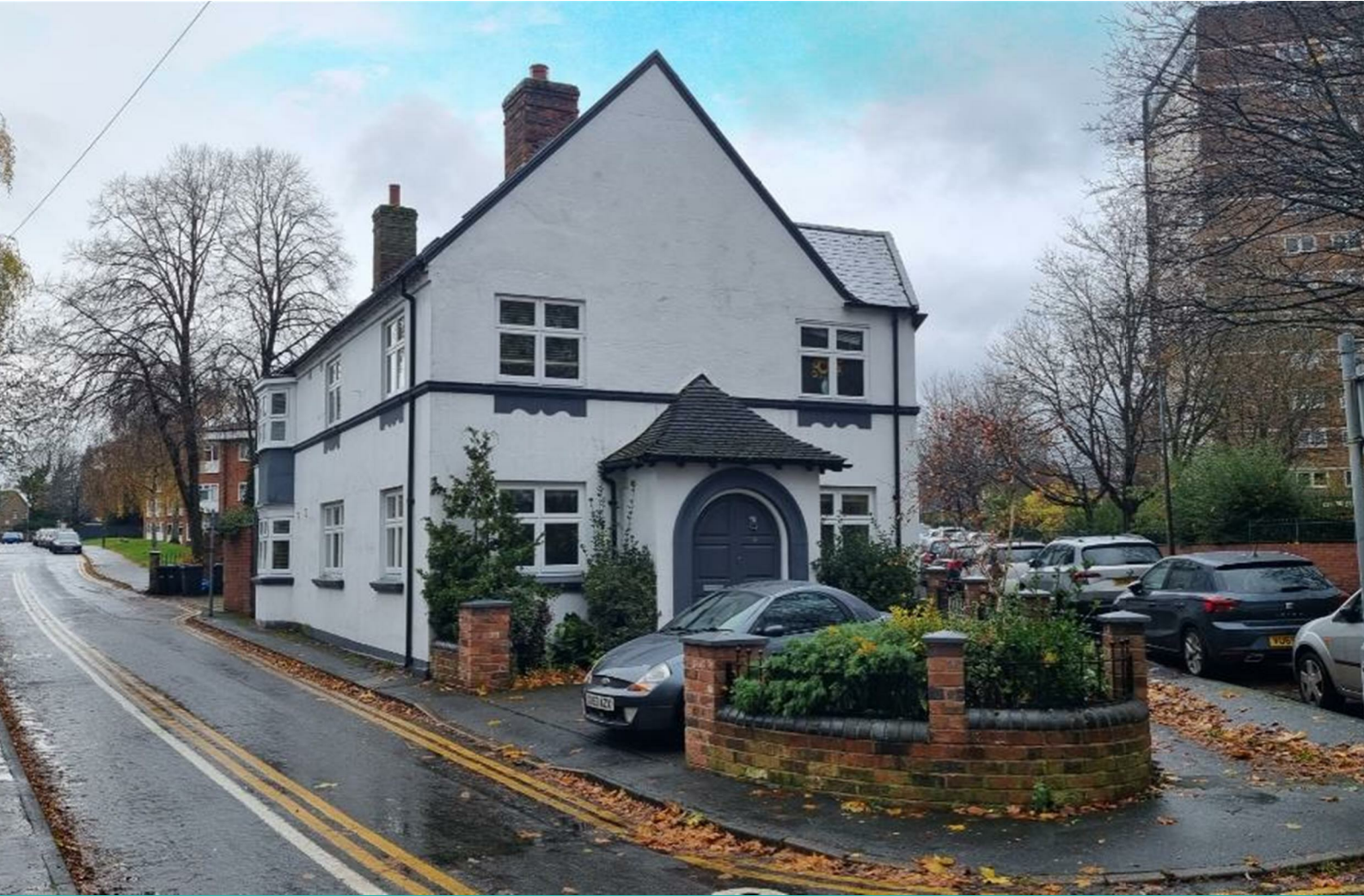
5 Red Lion House, Stourbridge, DY8 1BW