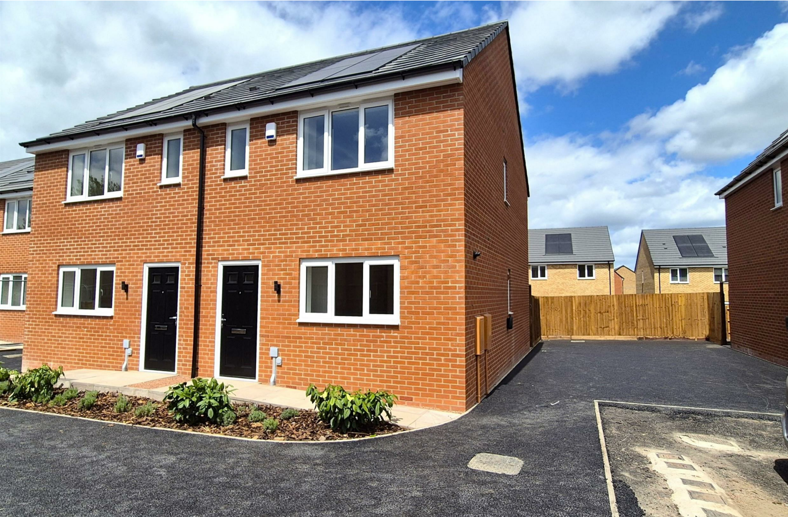
4 Fire Clay Mews, Kingswinford, DY6 7DG