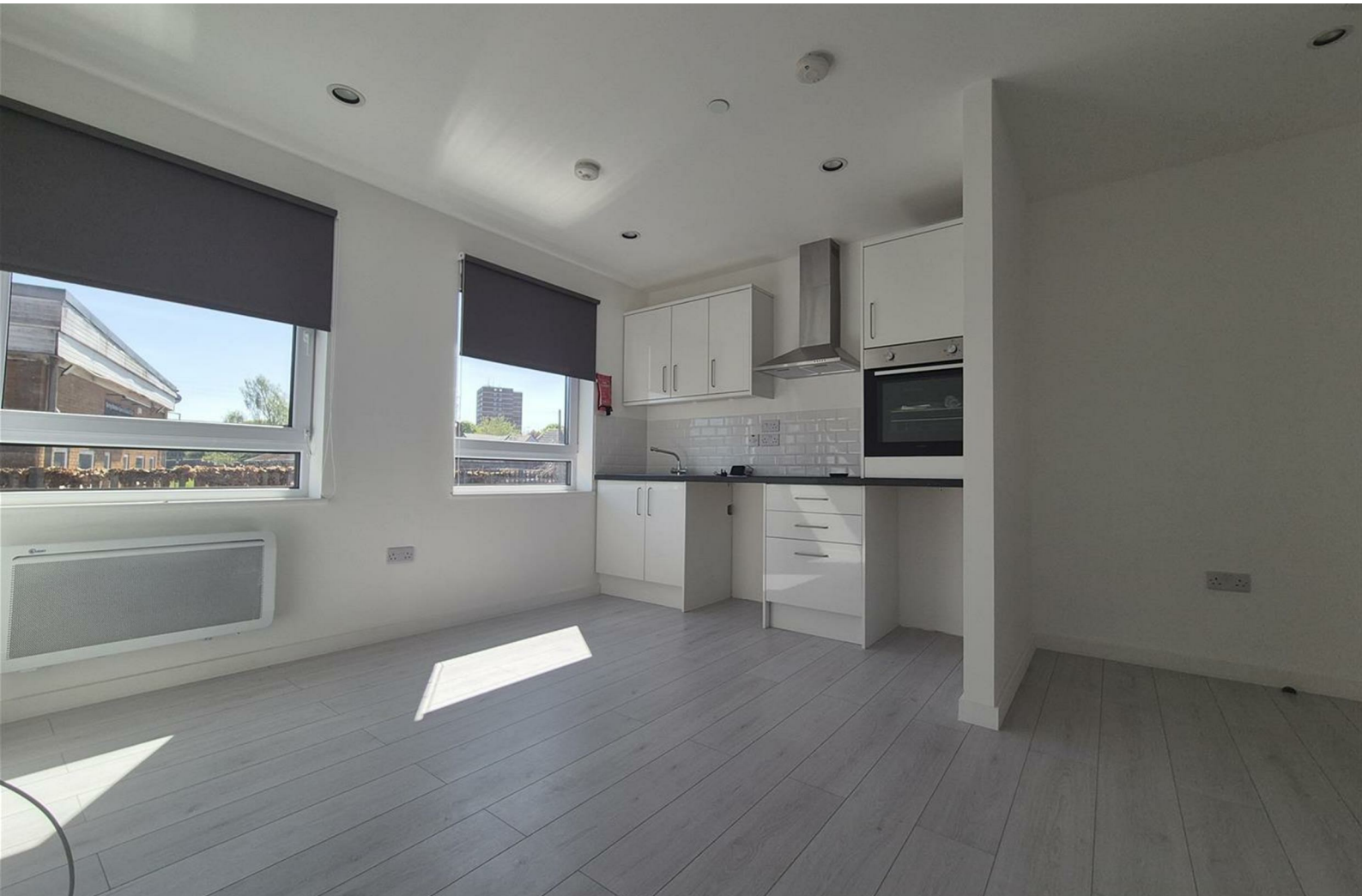
Flat 3 Priest House, Old Hill, B64 6JN