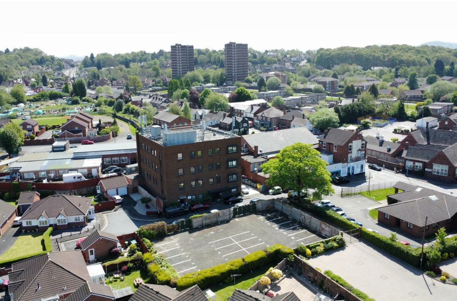
Priest House, Old Hill, B64 6JN