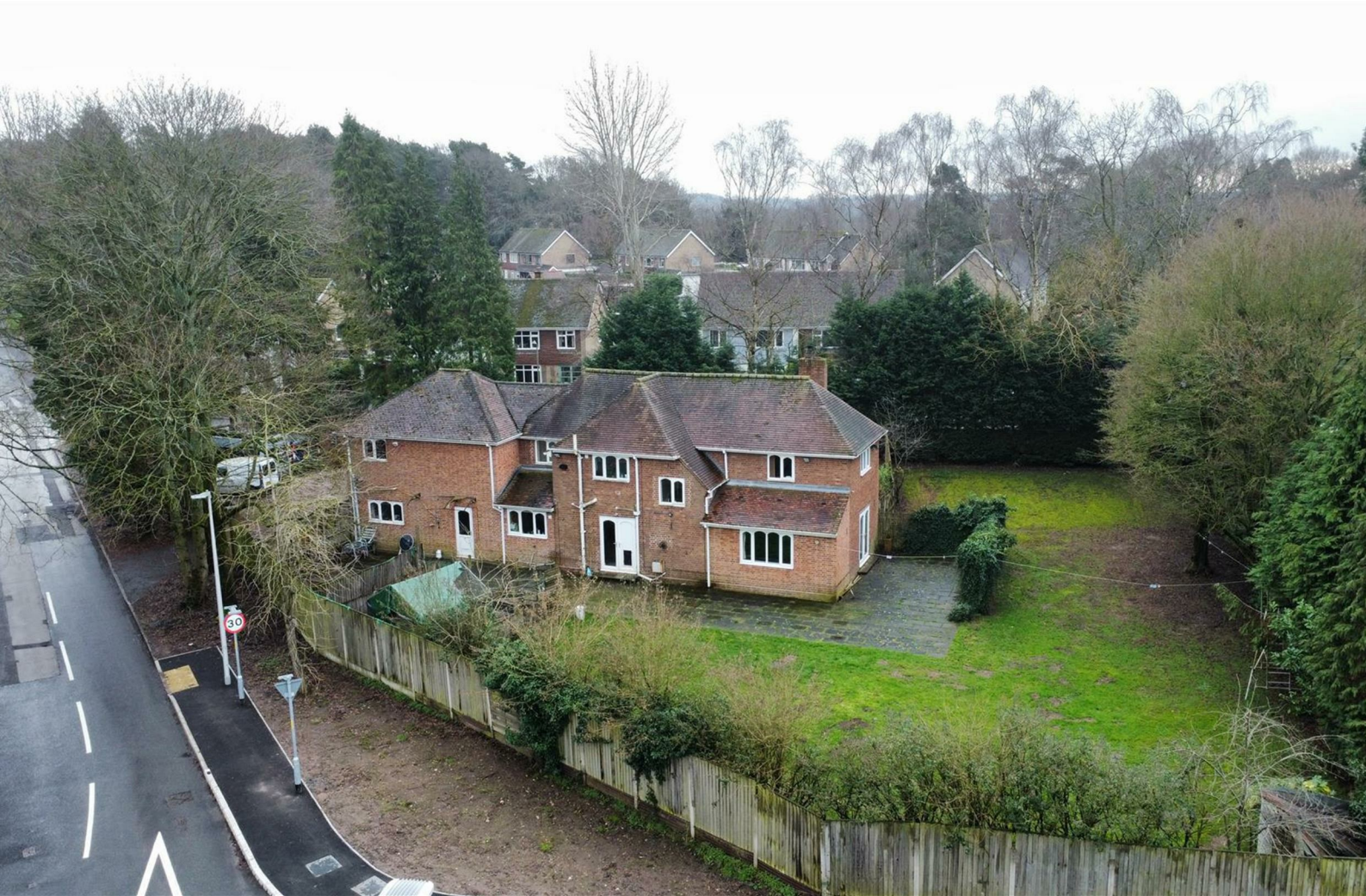
11 The Crescent, Kidderminster DY10 3RY