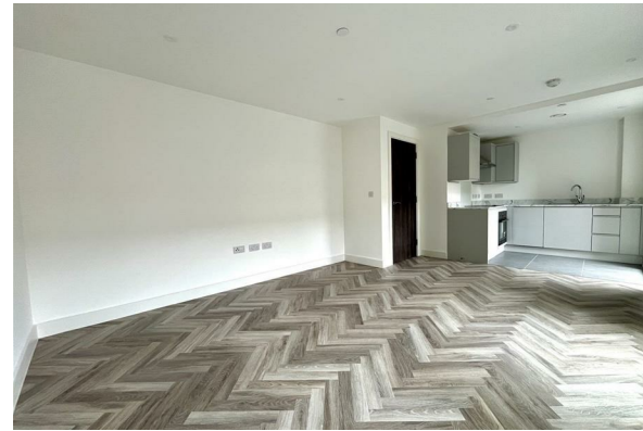
Your Text Here