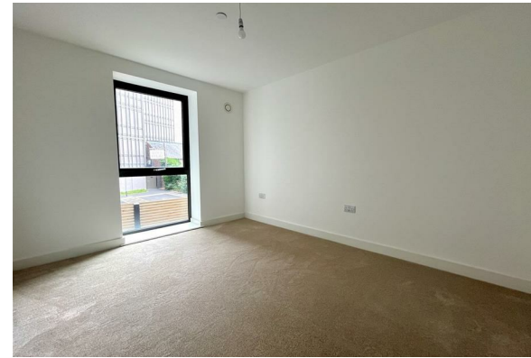
Your Text Here