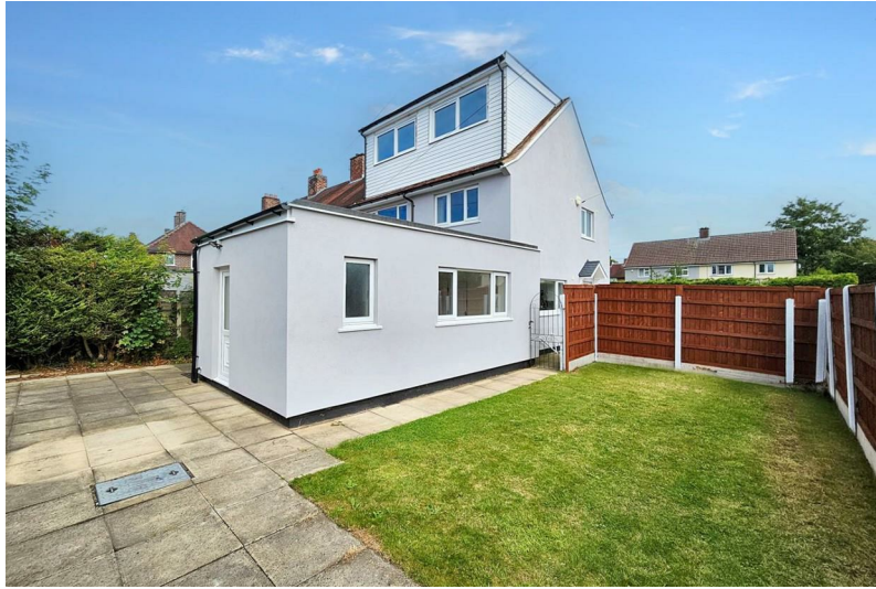
5 The Mount, Hale Barns, Altrincham, WA15 8SZ £1,800 PCM

INDEPENDENT ESTATE AGENTS PROPERTY SALES AND RENTALS