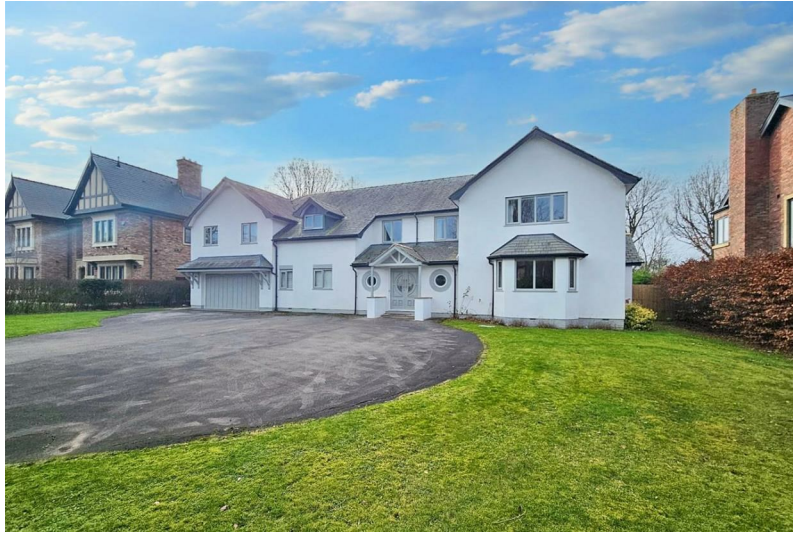
8 Theobald Road, Bowdon, Altrincham, WA14 3HG £6,950 PCM

INDEPENDENT ESTATE AGENTS PROPERTY SALES AND RENTALS