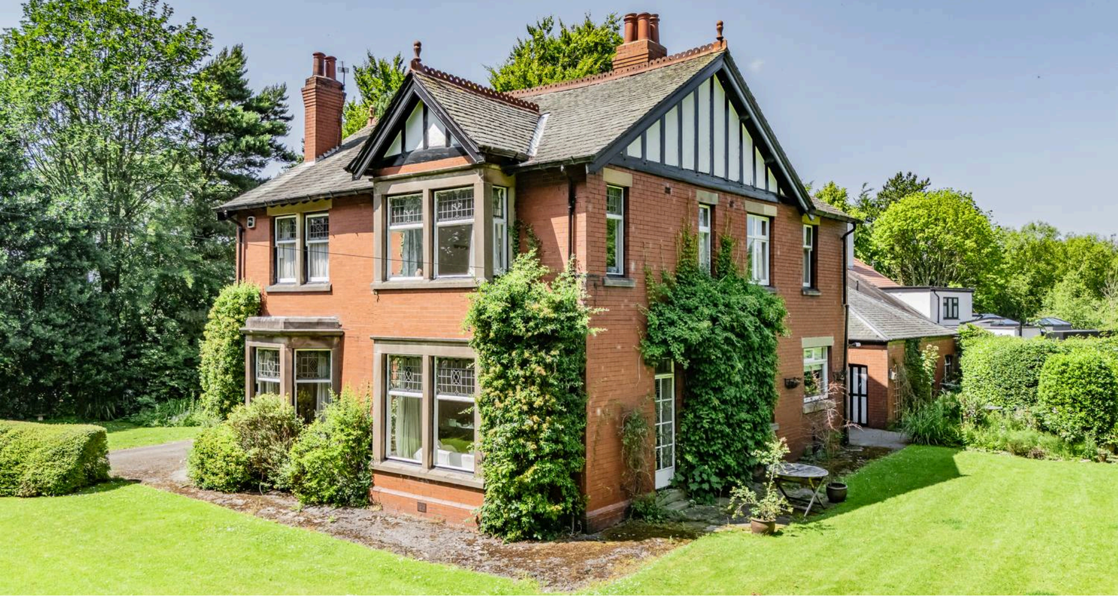
Beech Field, 267 Chapel Lane, New Longton Preston