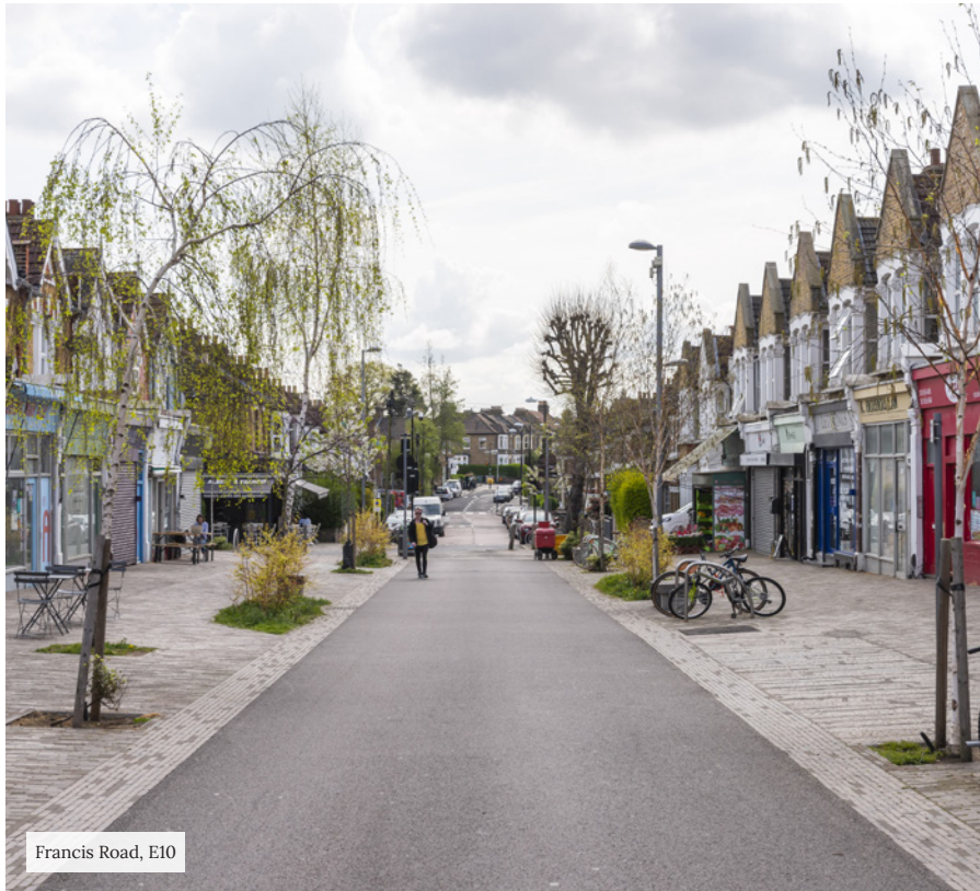
Francis Road, E10