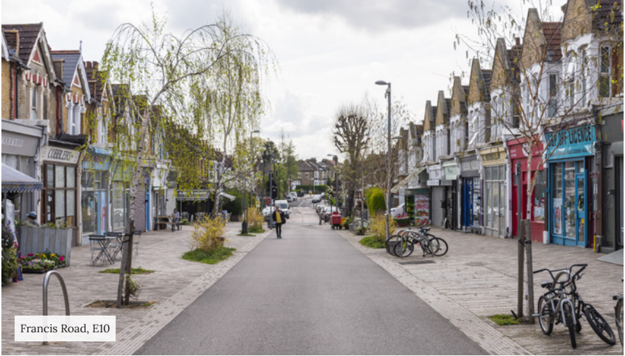
Francis Road, E10