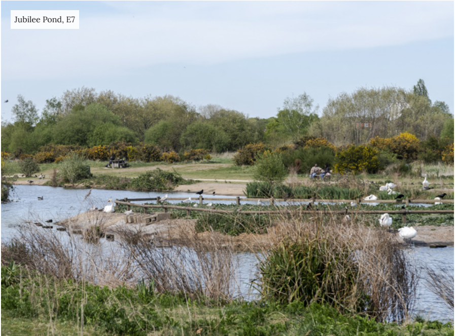
Jubilee Pond, E7

Shaftesbury Primary School (12 minutes) and Essex Primary (17 minutes). St Stephen's School (which also offers a great day-care and nursery) is a 16-minute walk away and was named The Times State Primary School of the Year 2018.