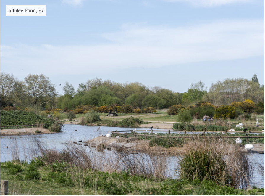
Jubilee Pond, E7