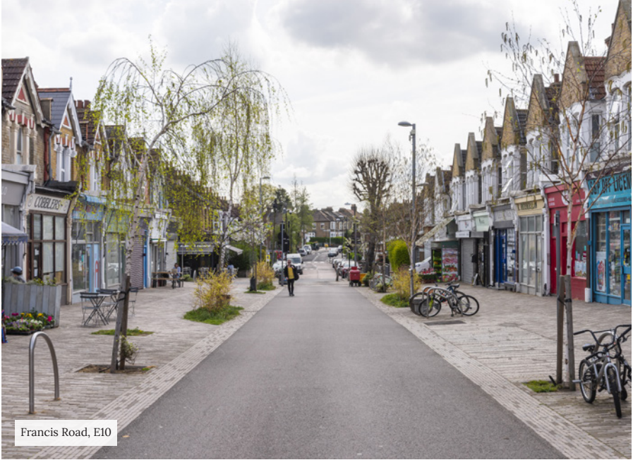
Francis Road, E10