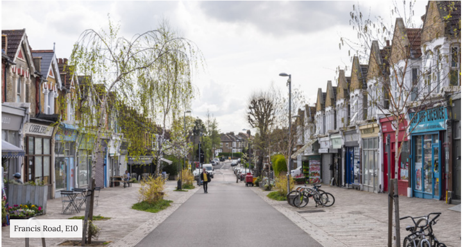
Francis Road, E10