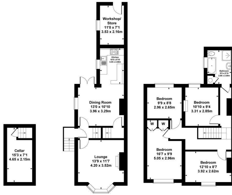
CELLAR Floor area 9.9 sq.m. (107 sq.ft.) approx GROUND FLOOR Floor area 39.6 sq.m. (426 sq.ft.) approx FIRST FLOOR Floor area 63.9 sq.m. (688 sq.ft.) approx

Approximate Gross Internal Area Main House = 1221 sq ft - 113.4 sq m Workshop/Store = 73 sq ft - 6.8 sq m Total = 1294 sq ft - 120.2 sq m