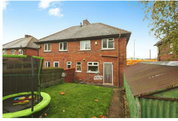
To the rear of the property is a laid to lawn garden with outside storage.