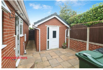
The property boasts of a open garden with lawn area and driveway with single detached garage.