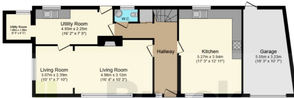
Ground Floor Floor area 90.4 sq.m. (973 sq.ft.)