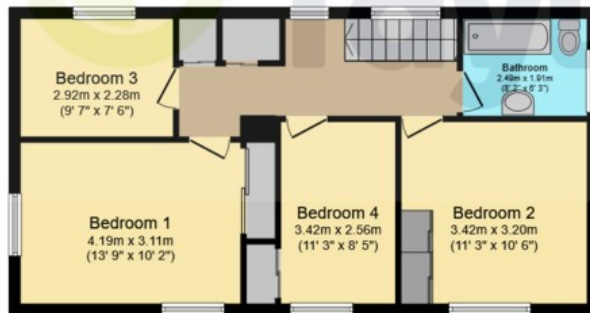
First Floor Floor area 58.4 sq.m. (628 sq.ft.)