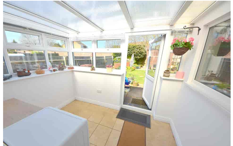
5 Cheviot Way, Banbury, Oxfordshire. OX16 1YB Guide Price £267,500 - Freehold