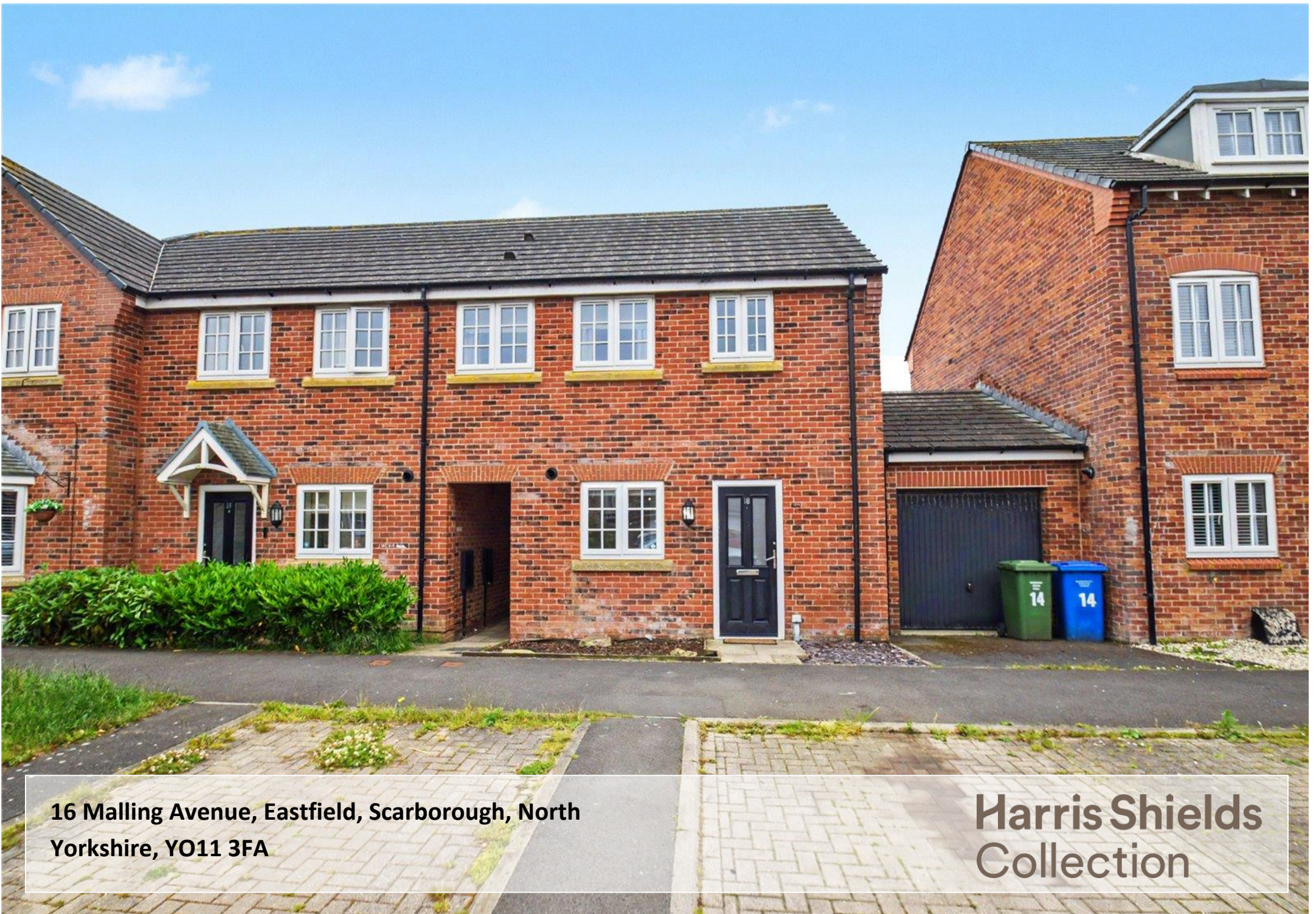
16 Malling Avenue, Eastfield, Scarborough, North Yorkshire, YO11 3FA