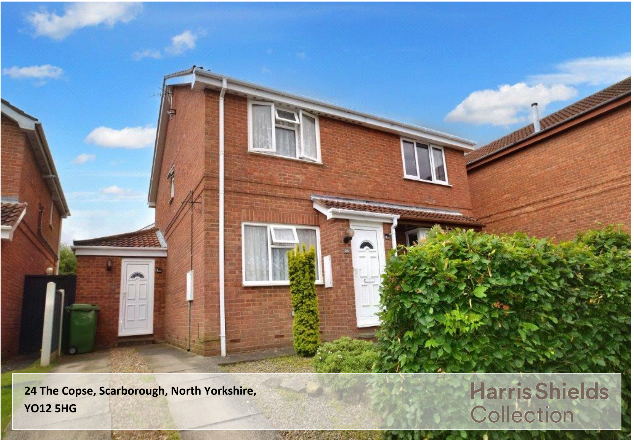
24 The Copse, Scarborough, North Yorkshire, YO12 5HG