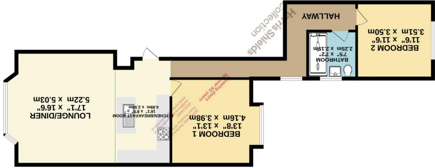
GROUND FLOOR 877 sq.ft. (81.5 sq.m.) approx.

TOTAL FLOOR AREA: 877 sq.ft. (81.5 sq.m.) approx.