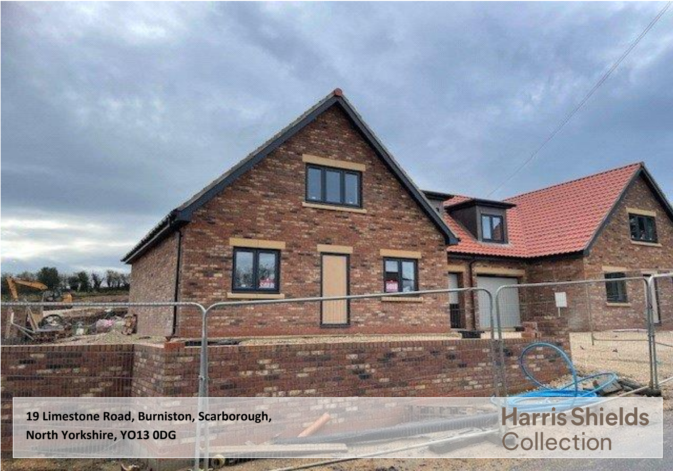
19 Limestone Road, Burniston, Scarborough, North Yorkshire, YO13 0DG