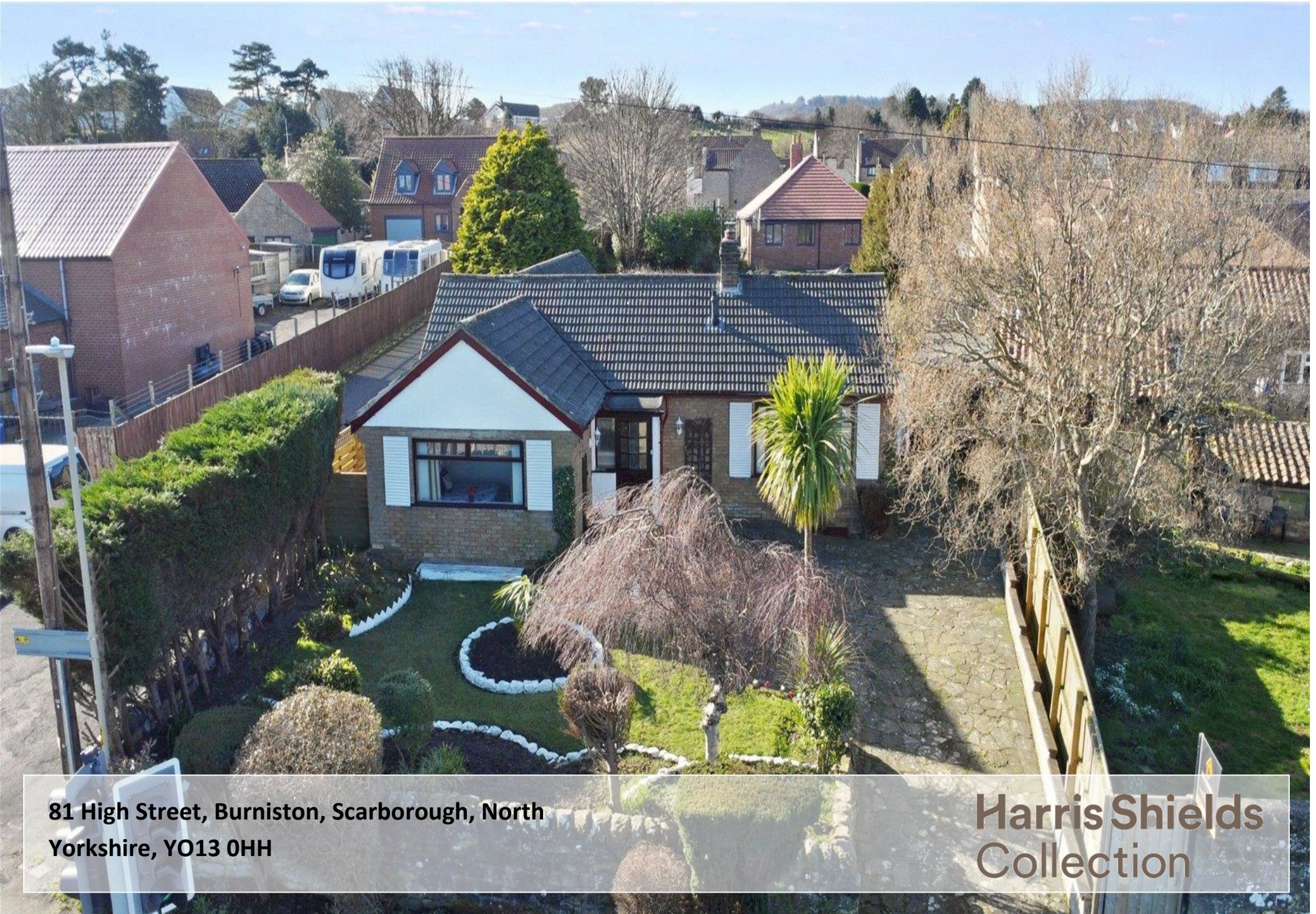
81 High Street, Burniston, Scarborough, North Yorkshire, YO13 0HH