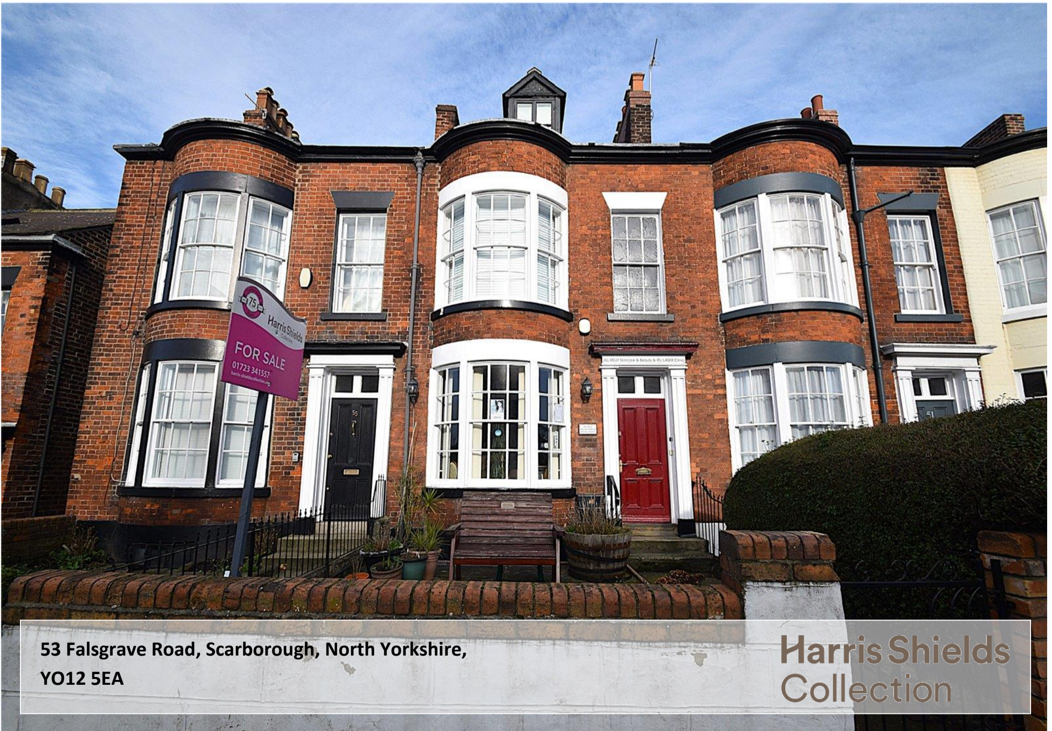
53 Falsgrave Road, Scarborough, North Yorkshire, YO12 5EA