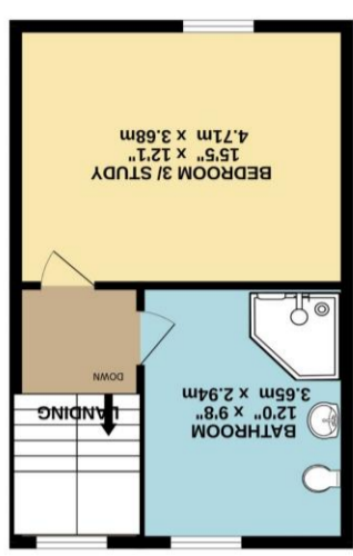
2ND FLOOR 372 sq. ft. (34.5 sq. m.) approx.

Whilst every attempt has been made to ensure the accuracy of the floorplan contained here, measurements of doors, windows, rooms and other areas are approximate and no responsibility is taken for any error. Prospective purchasers, tenants and any others are advised to verify the accuracy of the floorplan as to their own satisfaction. The services, systems and appliances shown have not been tested and no guarantee is given.