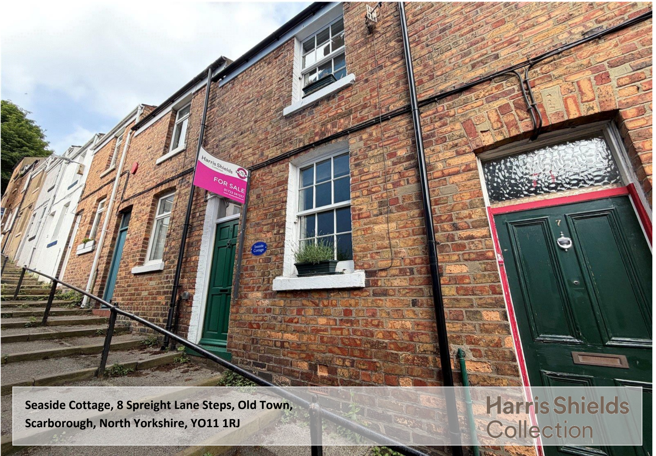
Seaside Cottage, 8 Spreight Lane Steps, Old Town, Scarborough, North Yorkshire, YO11 1RJ

Harris Shields Collection For sale for part 01723 341577 01723 341577 01723 341577