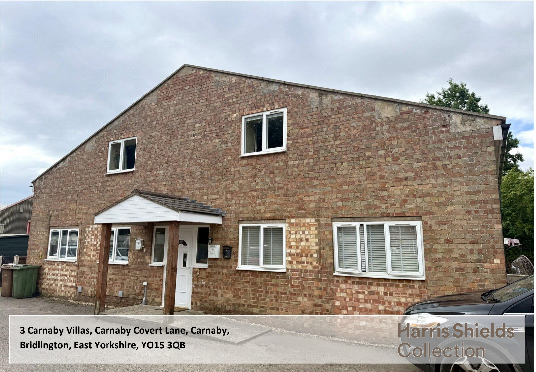
3 Carnaby Villas, Carnaby Covert Lane, Carnaby, Bridlington, East Yorkshire, YO15 3QB