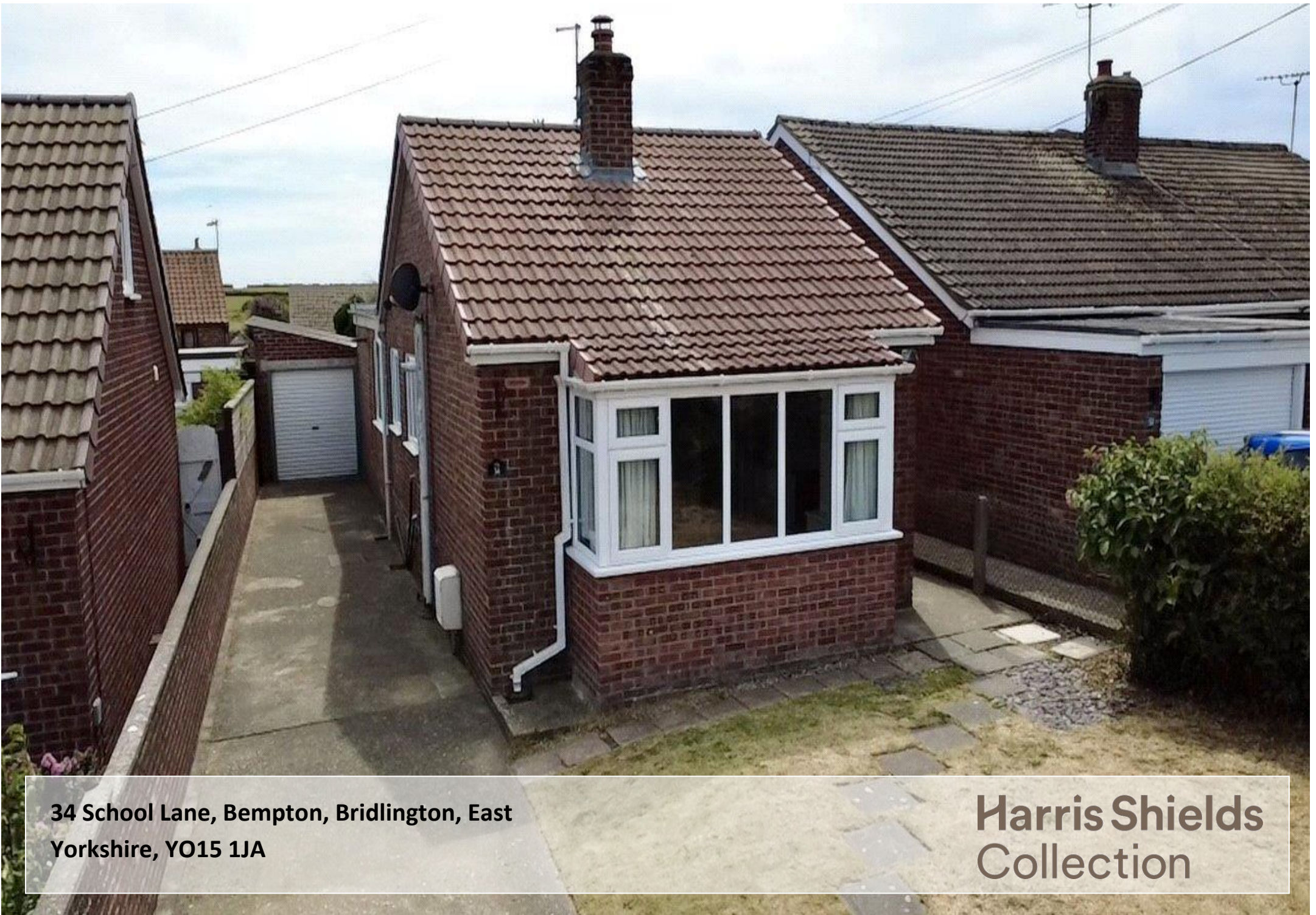
34 School Lane, Bempton, Bridlington, East Yorkshire, YO15 1JA