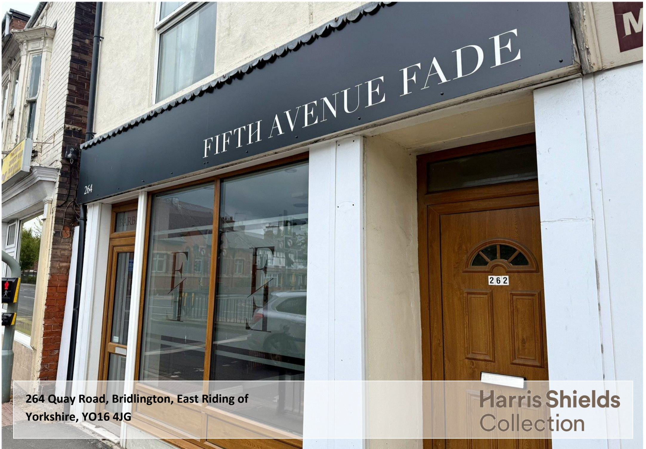
264 Quay Road, Bridlington, East Riding of Yorkshire, YO16 4JG