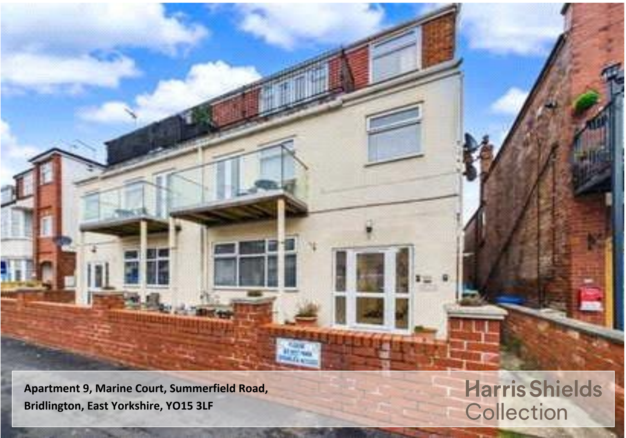
Apartment 9, Marine Court, Summerfield Road, Bridlington, East Yorkshire, YO15 3LF