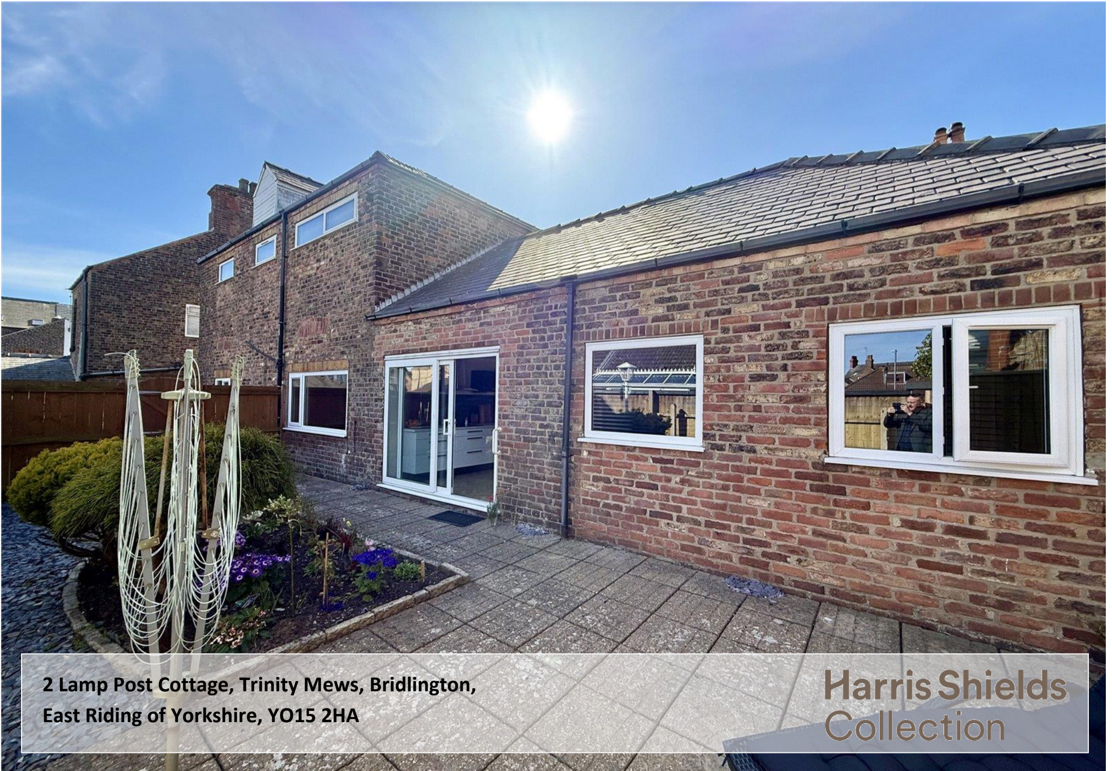
2 Lamp Post Cottage, Trinity Mews, Bridlington, East Riding of Yorkshire, YO15 2HA