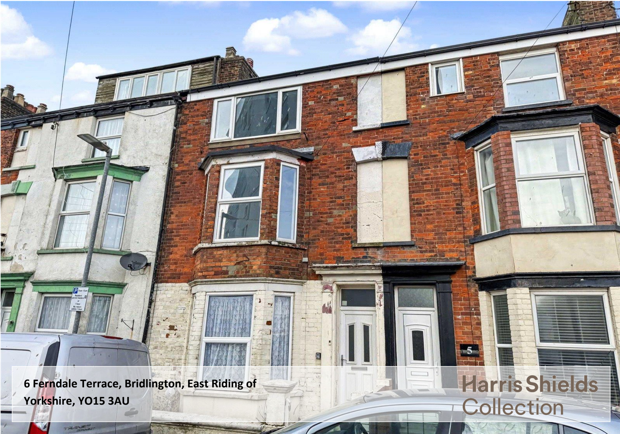
6 Ferndale Terrace, Bridlington, East Riding of Yorkshire, YO15 3AU