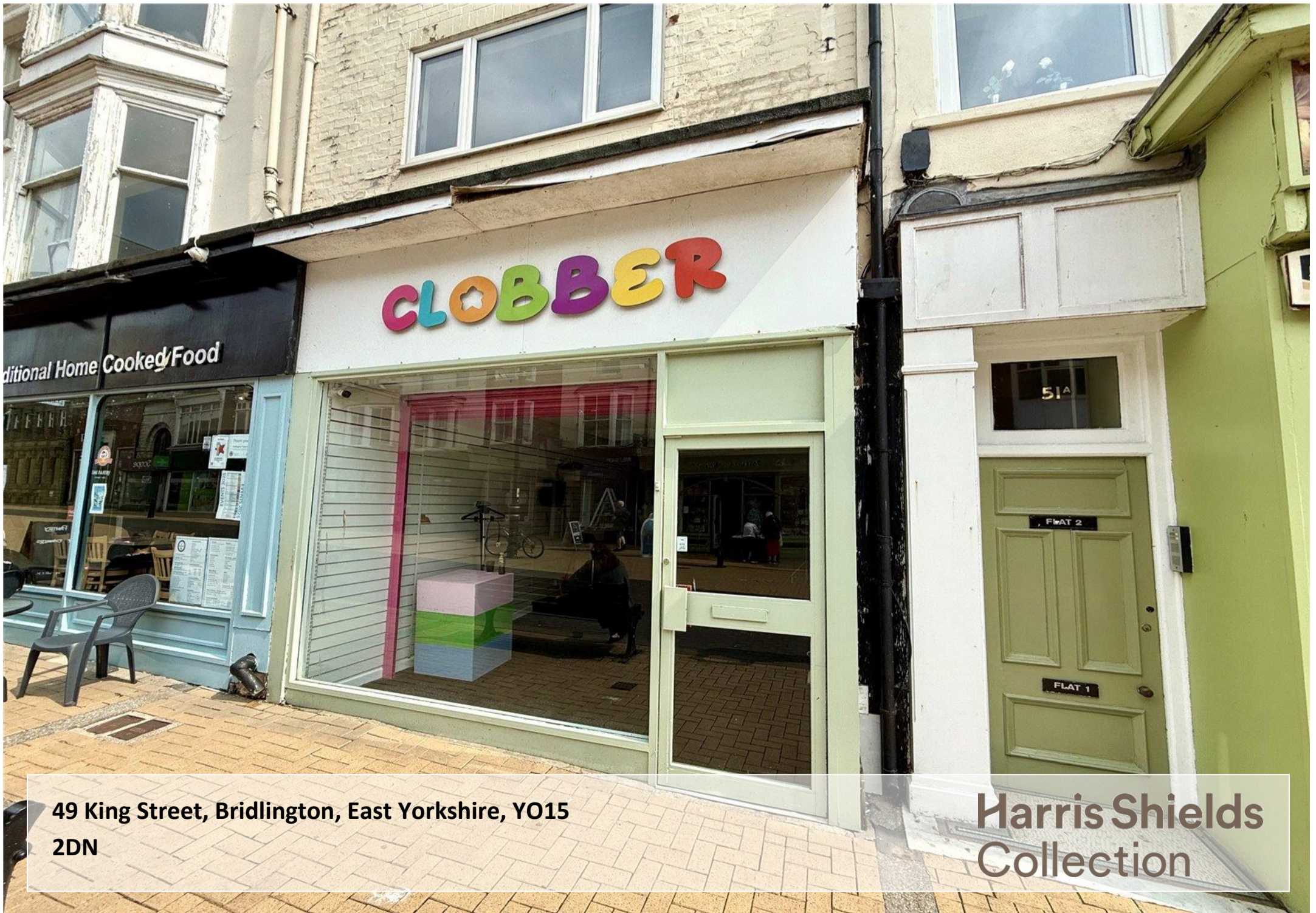
49 King Street, Bridlington, East Yorkshire, YO15 2DN