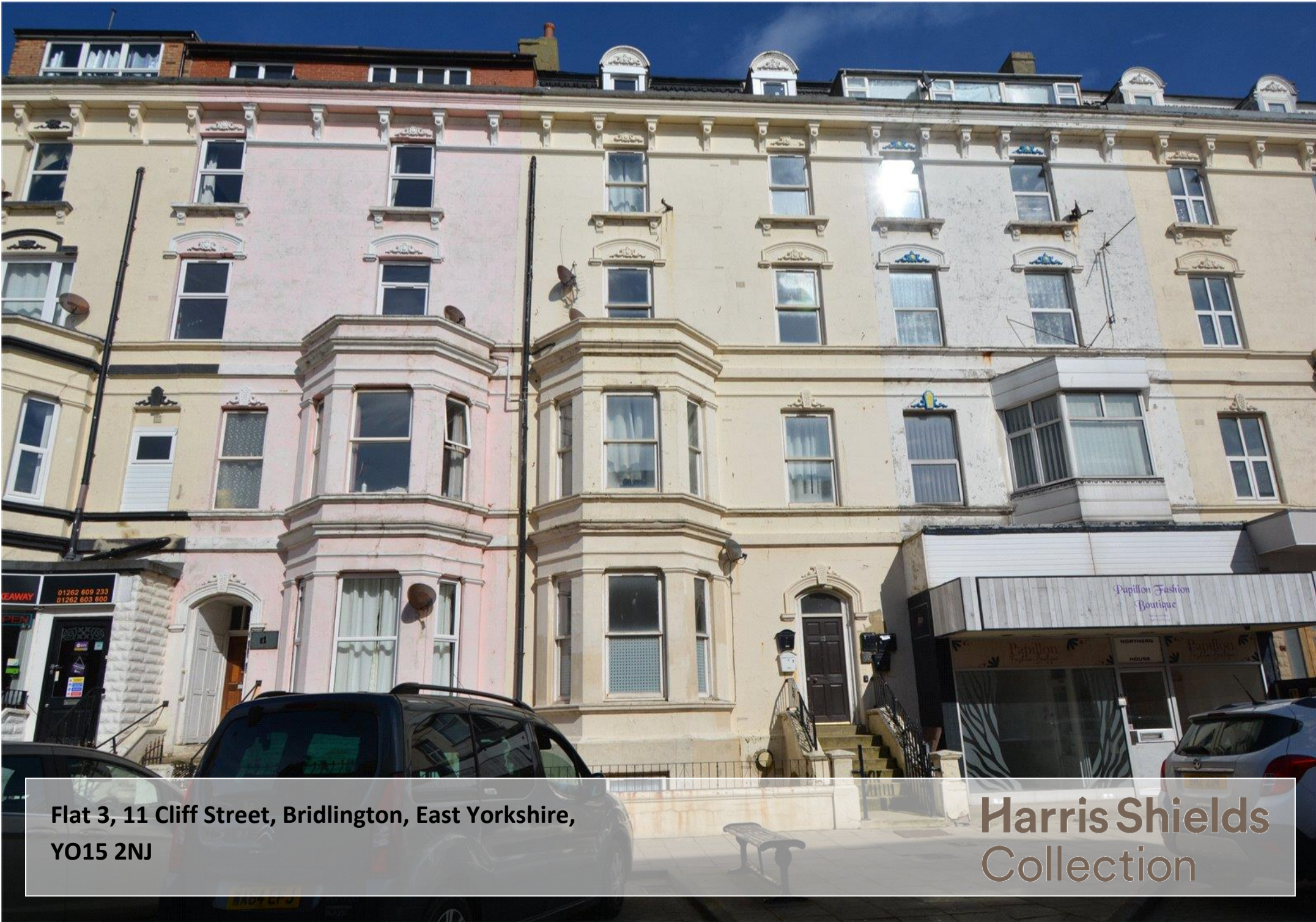
Flat 3, 11 Cliff Street, Bridlington, East Yorkshire, YO15 2NJ