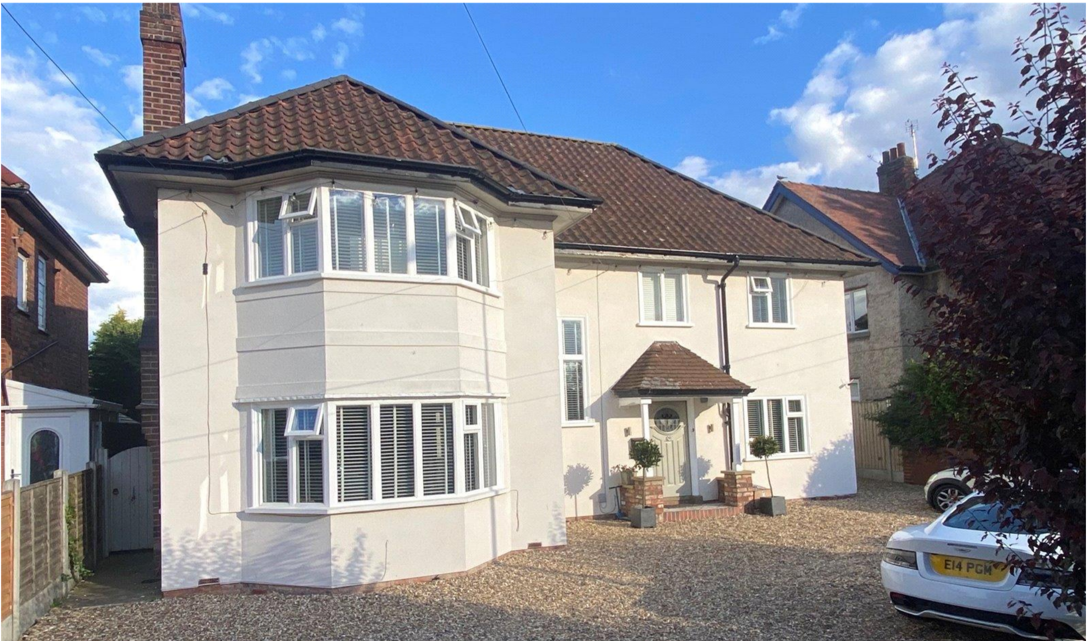
95 Kingsgate, Bridlington, East Yorkshire, YO15 3NG