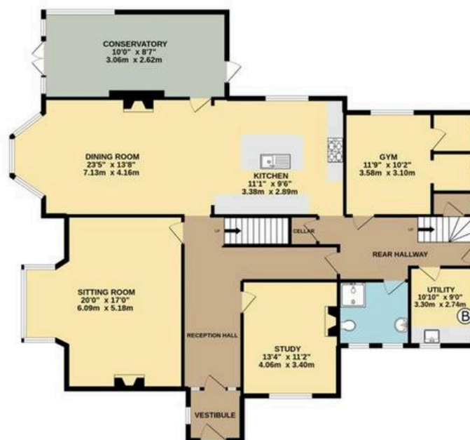
GROUND FLOOR 1849 sq.ft. (171.8 sq.m.) approx.