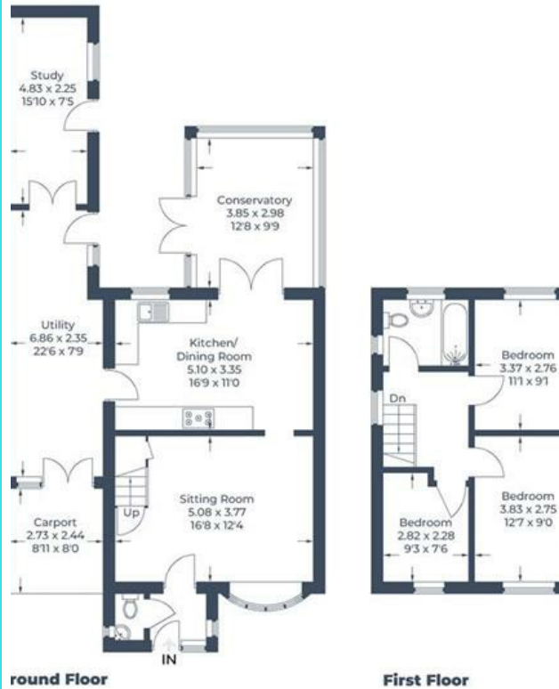
Illustration for identification purposes only, measurements are approximate, not to scale. © CJ Property Marketing Produced for Fine Homes Property

Approximate Gross Internal Area Ground Floor = 80.5 sq m / 866 sq ft First Floor = 36.9 sq m / 397 sq ft Total = 117.4 sq m / 1,263 sq ft (Excluding Carport)