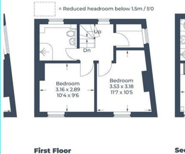
Illustration for identification purposes only, measurements are approximate, not to scale. © CJ Property Marketing Produced for Fine Homes Property

Approximate Gross Internal Area Ground Floor = 35.2 sq m / 379 sq ft First Floor = 31.0 sq m / 334 sq ft Second Floor = 32.8 sq m / 353 sq ft Total = 99.0 sq m / 1,066 sq ft