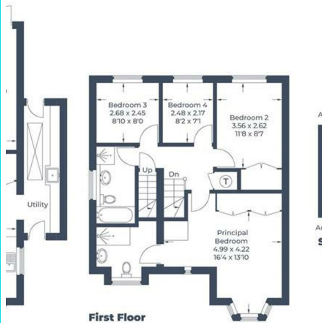
Illustration for identification purposes only, measurements are approximate, not to scale. © CJ Property Marketing Produced for Fine Homes Property

Approximate Gross Internal Area Ground Floor = 80.7 sq m / 869 sq ft First Floor = 63.8 sq m / 687 sq ft Second Floor = 27.3 sq m / 294 sq ft Garage = 12.9 sq m / 139 sq ft Total = 184.7 sq m / 1,989 sq ft