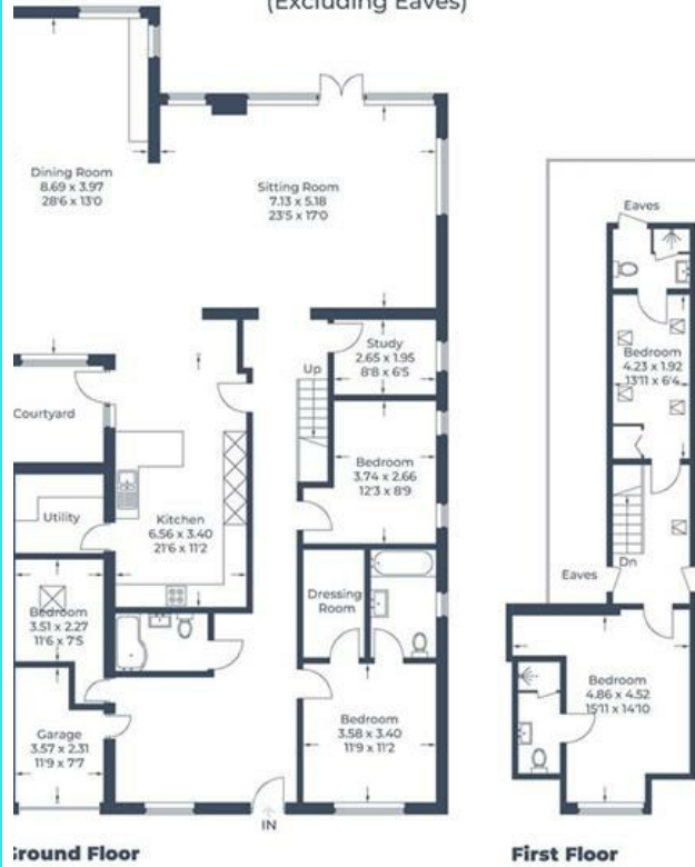
Illustration for identification purposes only, measurements are approximate, not to scale. © CJ Property Marketing Produced for Fine Homes Property

Approximate Gross Internal Area Ground Floor = 193.0 sq m / 2,077 sq ft First Floor = 39.9 sq m / 429 sq ft Garage = 7.1 sq m / 76 sq ft Total = 240.0 sq m / 2,582 sq ft (Excluding Eaves)