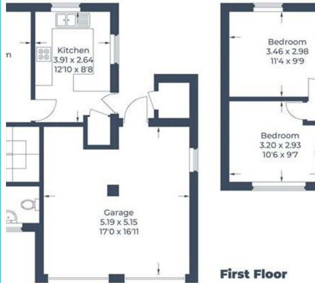
Illustration for identification purposes only, measurements are approximate, not to scale. © CJ Property Marketing Produced for Fine Homes Property

Approximate Gross Internal Area Ground Floor = 60.2 sq m / 648 sq ft First Floor = 58.8 sq m / 633 sq ft Garage = 25.9 sq m / 279 sq ft External Cupboard = 1.4 sq m / 15 sq ft Total = 146.3 sq m / 1,575 sq ft