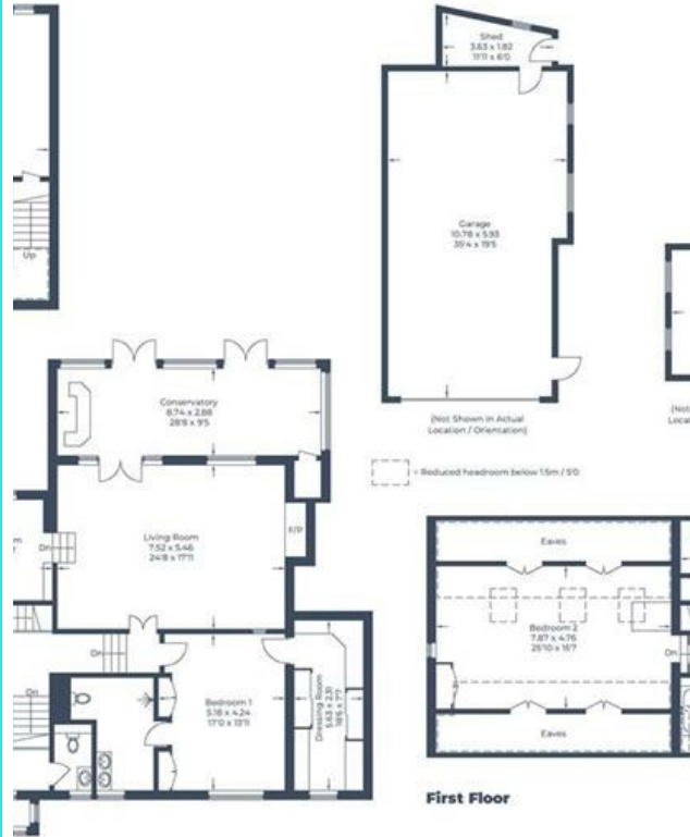
Illustration for identification purposes only, measurements are approximate, not to scale. © C3 Property Marketing Produced for Fine Homes Property

Approximate Gross Internal Area (Including Garage) Lower Ground Floor = 66.5 sq m / 716 sq ft Ground Floor = 219.8 sq m / 2,366 sq ft First Floor = 120.5 sq m / 1,297 sq ft Outbuildings = 80.0 sq m / 861 sq ft Total = 486.8 sq m / 5,240 sq ft