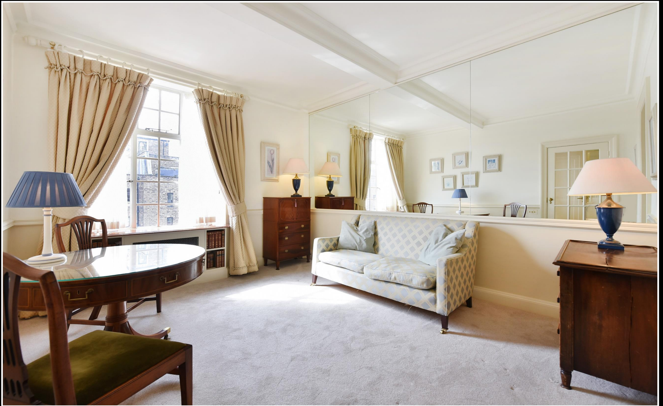
Hallam Street, W1W £650 p/w Furnished